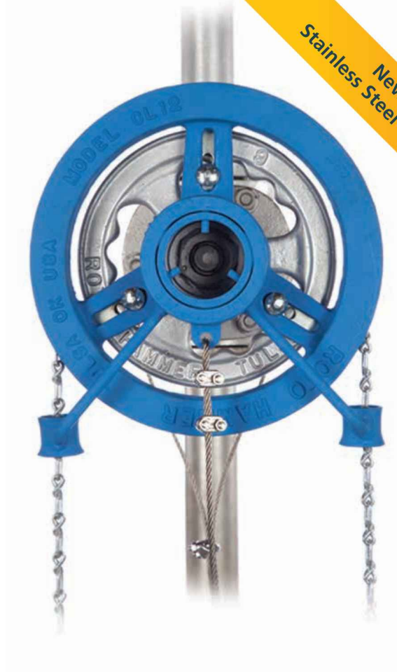
CL-Series – Clamp-On Chainwheel